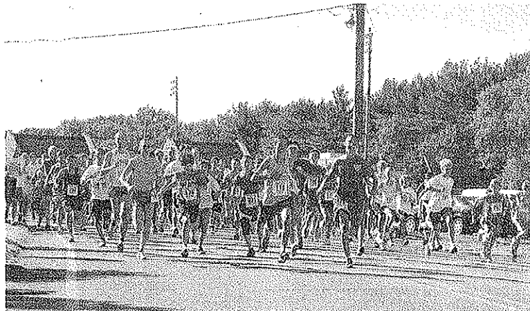
Two-hundred forty-six runners take off at the 18th Annual Labor Day 5K Race.